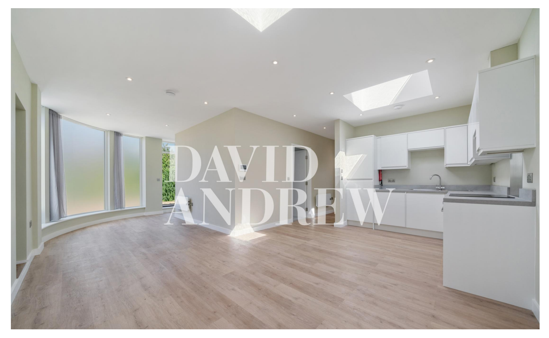
Fortis Green, N2 9HR