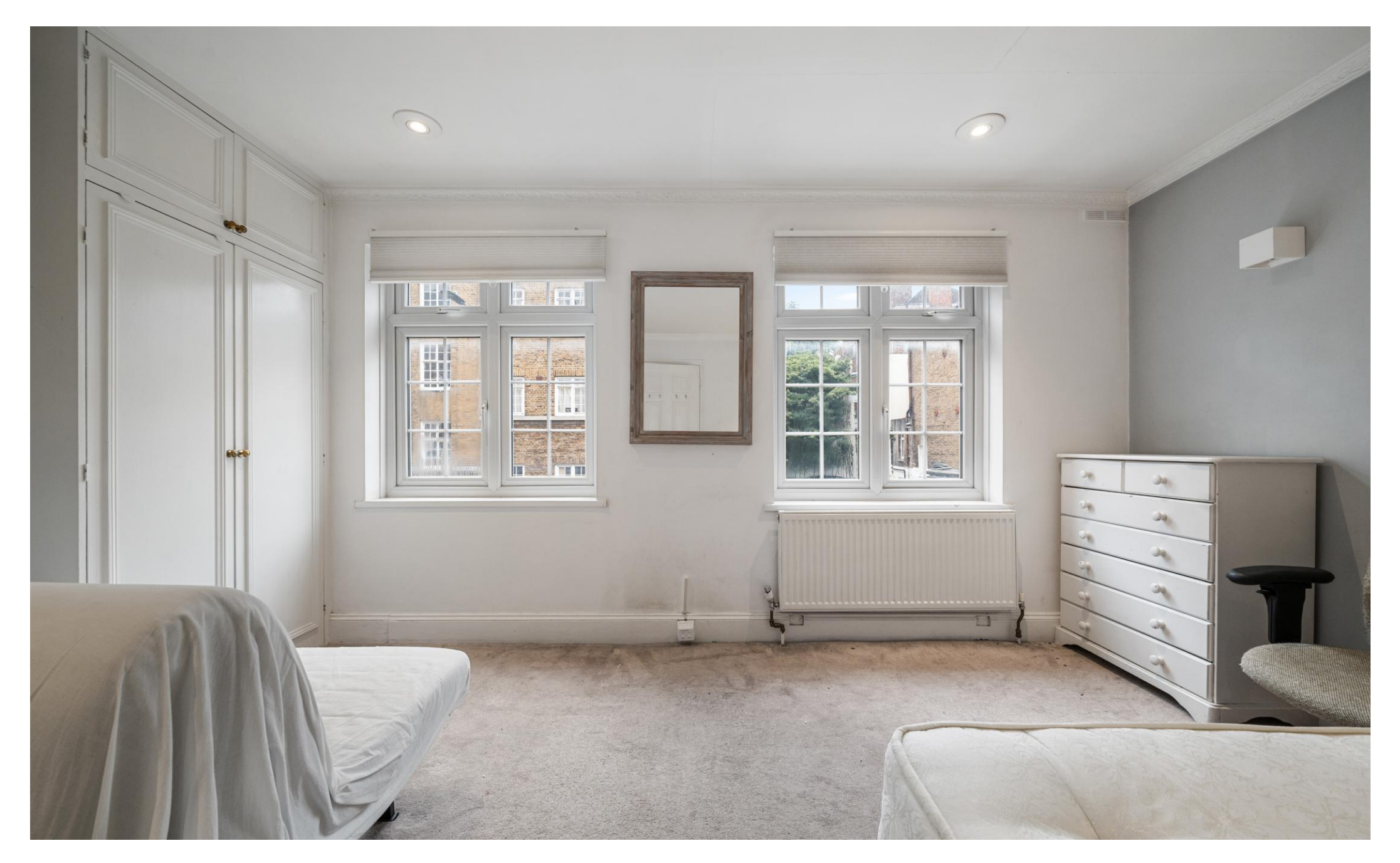
Bell Street, NW1 6TB